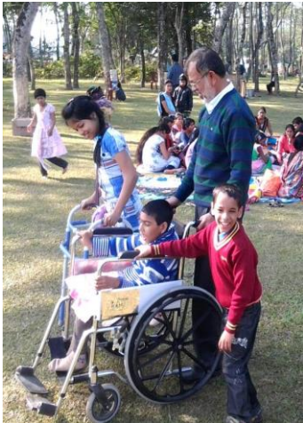
Children at Tapoban