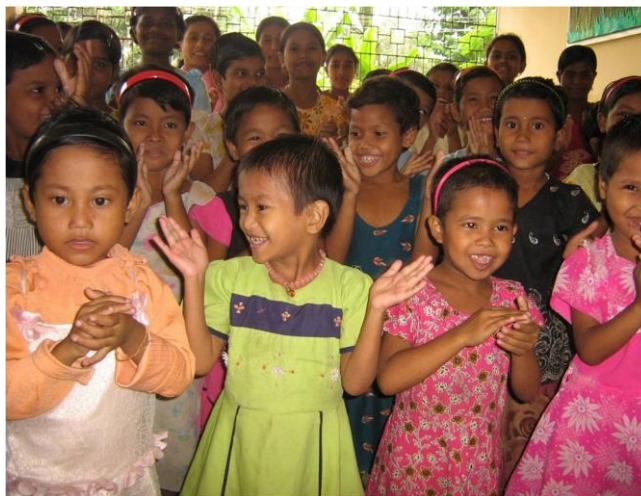
'Spreading Sunshine' Project: Caring and sharing with the marginalized, sharing a happy moment with the less privileged children in an institution for girls.