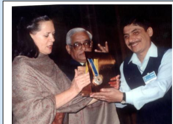
On behalf of the disabled, receiving the Helen Keller NCPEDP Award in 2000, for promoting employment of the disabled.